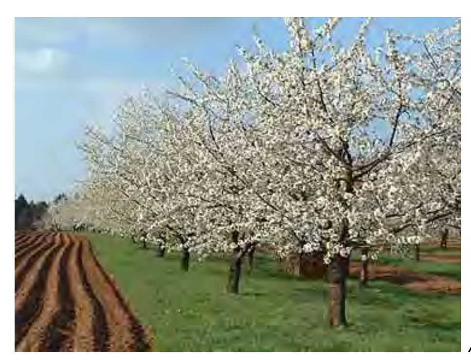
A cherry orchard